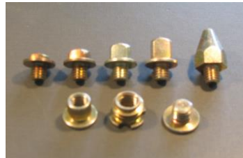
Studs and Thread Inserts