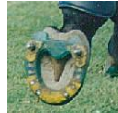
ew in show jumping

sirexport GmbH 3871 Alt-Nagelberg, Hauptstr. 45 AUSTRIA